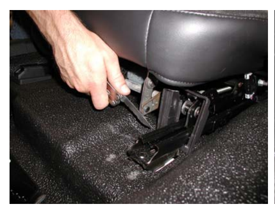
Cut floor mat, next to the seat rail to allow Under seat support bracket to slide under seat rail